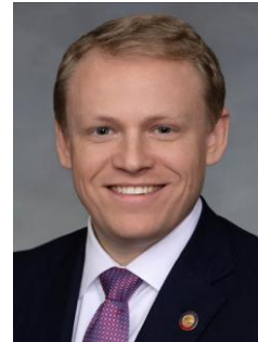
NC General Assembly House Speaker Destin Hall