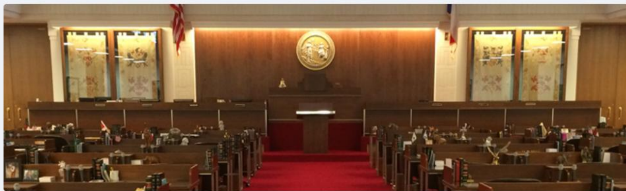
North Carolina House of Representatives, North Carolina General Assembly Raleigh, North Carolina