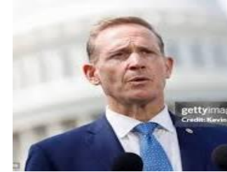
US Senator Ted Budd