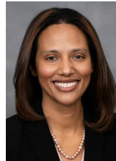
NC Senate Minority Leader Senator Sydney Batch